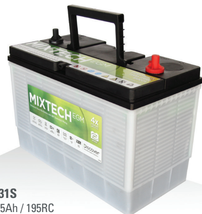
EGM XCL-31S 800CCA / 105Ah / 195RC Extreme Peak Capacity Cycle Life